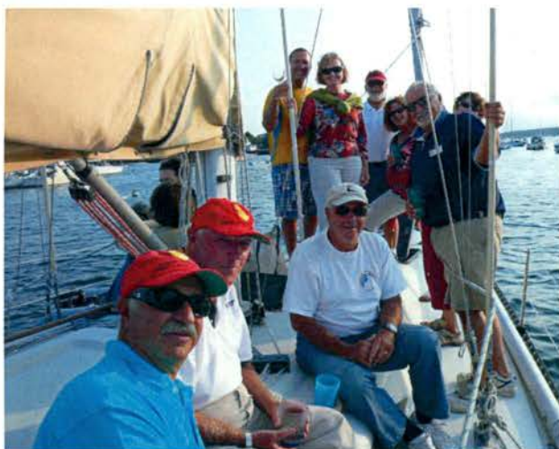
Some of the "ballast" on Winterhawk

NY) and Bluenose II (Lunenburg, Nova Scotia) , among others.