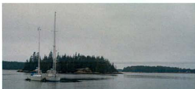
Quintessence and friend at Long Cove

We entered Leadbetter Sound under power, and the fog closed in again with visibility at the southern end as little as 25 feet. We were encouraged by radio traffic from those in Long Cove that the sun was shining there. At the very end of the Sound, we broke out of the fog into clear skies and a calm anchorage. A number of boats were already present having arrived from other areas of Penobscot Bay and the Stonington area. A Cocktail party was held on Isolde .