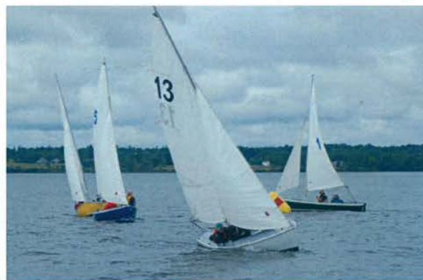
Rounding the windward mark

The fifth day was to be a lay day in Castine, with an afternoon of one design dinghy racing put on by the Maine Maritime Academy. With early morning rain and drizzle, and absolutely no wind, it did not look promising. However, by noon, the rain had let up, and a slight breeze developed, enabling the racing to go forward. The entire event was organized by Maine Maritime Academy who provided a Committee boat, a crash boat, set the course, kept the score, and provided as many dinghies in the form of Mercury 15's as needed. In all, seven BWSC crews were mustered for four heats around a short windward-leeward course. The winds remained light