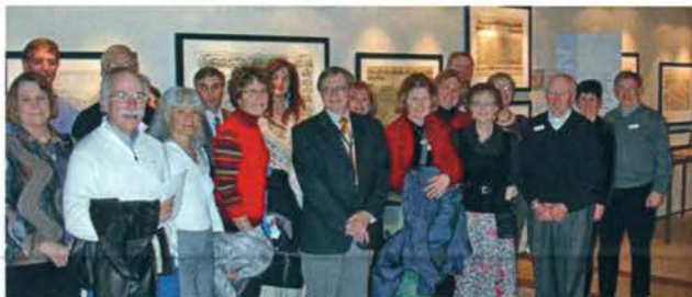
At the Boston Public Library

Our tour concluded with the well-known John Singleton Copley's action painting of Watson and the Shark with the shark attacking 14-year-old Watson. The evening ended with an elegant dinner at Bravo restaurant.