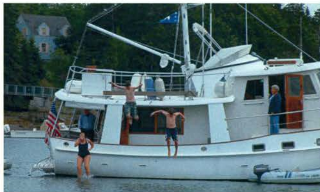
Diving contest off Carina

for the evening and overnight, with no wind. The now nightly cocktail party was held aboard Romance .