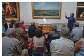
At the MFA

We then had a curator's tour of the current exhibition "A Bird's Eye View of Boston" by Ronald Grimm. He gave interesting insights into the maps of Boston and its suburbs. The maps were drawn as if from a bird's view from above while we viewed the same place from the ground. Many, more than a century old were interesting to see with the changes that have taken place in these locations that still exist today.