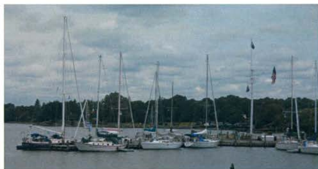
At Mystic Seaport