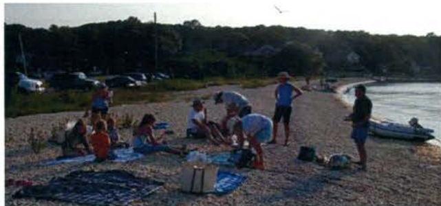
Picnic at Noyack Bay

storm would abate, and then start up again. (As the storms pass over New York City, they gather heat and then hit dump the additional energy over Long Island and the Sound.)