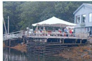
The Deck at the Great Island Boat Yard

On August 1, boats of the Blue Water Sailing Club began to assemble at Great Island Boat Yard (GIBY) in Quahog Bay at the eastern end of Casco Bay