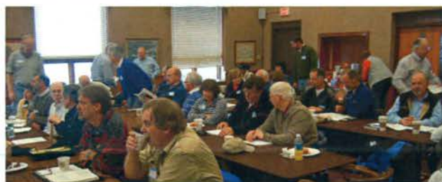
Weather Seminar Participants

If your sailing is day sailing, racing, coastal cruising, or offshore sailing, the one element that affects all of us, is weather. How often have you started out on your sailing activities only to be disappointed by the weather system that moved in forcing you to hunker down or head for a safe harbor?