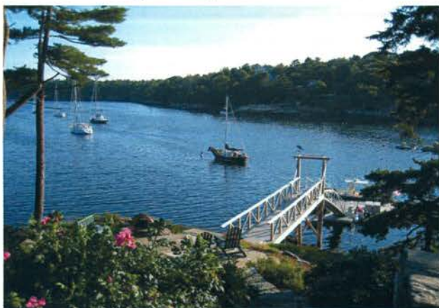
At ease in Harmon Harbor

The next day was clear and sunny but with very little wind. Boats motored and attempted to sail around Pemaquid Point, across Boothbay Harbor, on to Harmon's Harbor. Harmon's Harbor proved a snug anchorage, though a late developing swell broke across the harbor entrance making for a bouncy night. We had a pleasant surprise in the form of a resident of the harbor (the Darling's) who provided each boat with a plate of fresh-from-the-oven chocolate chip cookies. We invited the Darlings to our cocktail party planned for 5:30 but instead they invited us to their home overlooking the anchorage. They treated us to a full spread of Hors D'oeuvres and wine, and a tour of their beautiful home. We presented the Darlings with a BWSC burgee in thanks for their generosity.