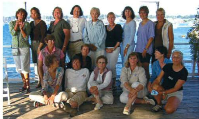
Women's Cruise Participants

tains who had never cruised without their significant others! We had many laughs and of course had wonderful food and drink. Each day brought new adventures. A few mechanical problems did not stand in the way of a successful cruise. Cuttyhunk and Newport were beautiful. The trust and friendship that developed over the course of the trip are irreplaceable. It goes without saying that everyone is looking forward to next year's adventure!