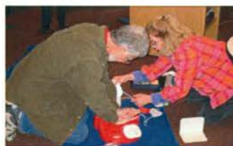
Getting ready for the AED

One of the educational seminars of the season was First Aid / CPR, which included AED (automatic external defibrillator) training. All forms of safety training helps